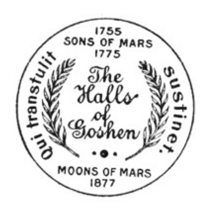
1755 SONS 0F MARS 1775