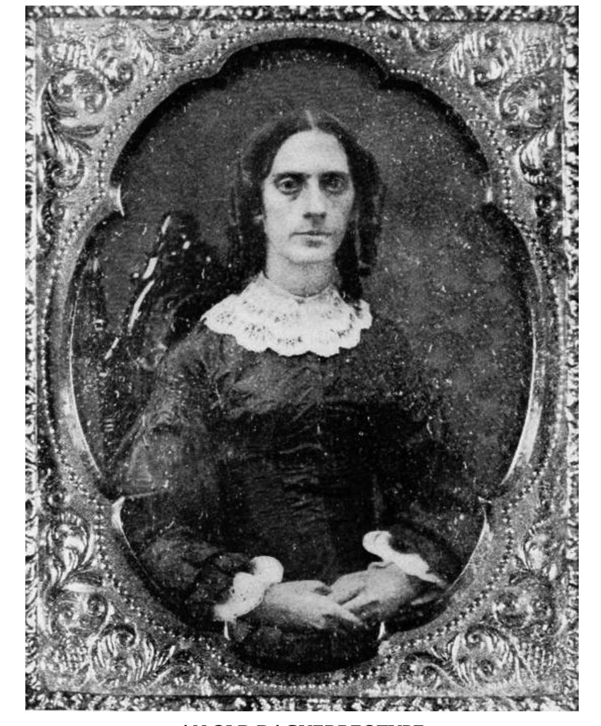
AN OLD DAGUERREOTYPE