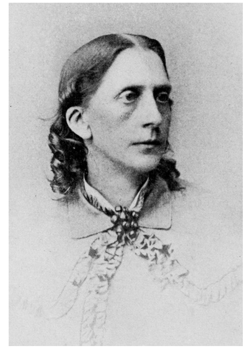
PHOTOGRAPH OF 1878

In person she was not remarkable—height about five feet three inches, weight with clothing about one hundred and twenty-three pounds. In middle life she was considerably bent over, more from years of toil than from physical weakness. Nervous strength was lacking; and early in life she lost her teeth. But her frame was well developed, her waist being as large as a Greek goddess's, for she scorned the use of corsets. Her smooth skin was of fine stout texture. Her well-shaped head was adorned by thin curls of wonderfully fine, dark hair, which even at the time of death showed hardly a trace of white. Straight mouth, high forehead, strong brow, large straight nose, and beautiful brown eyes indicated a woman of great spiritual force.