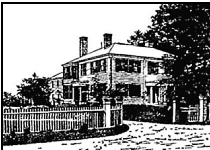
HOME OF EMERSON IN CONCORD.