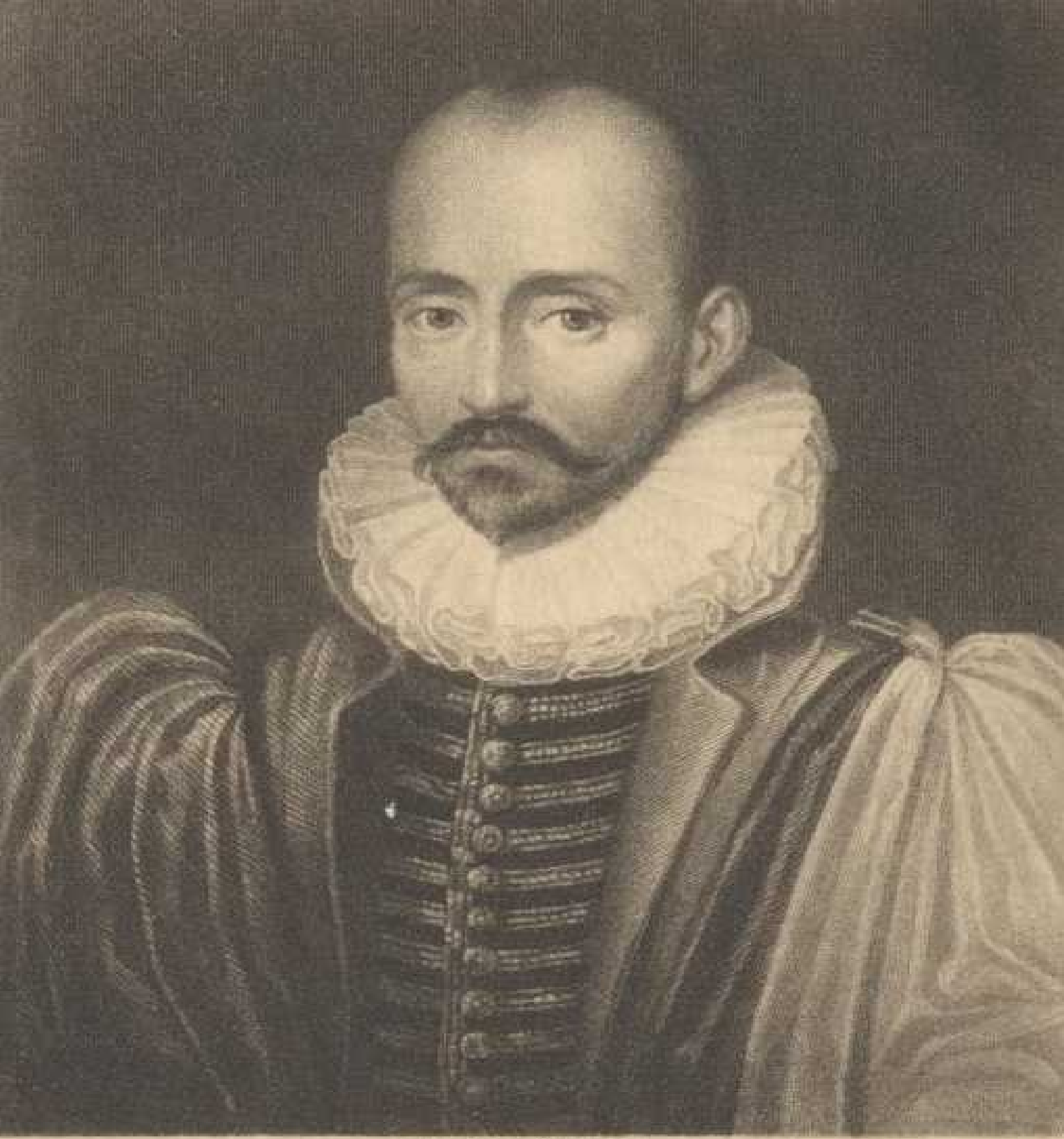
Engraved by C.E.Wagstair.