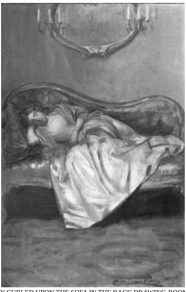
"SHE LAY CURLED UPON THE SOFA IN THE BACK DRAWING-ROOM."—P. 1. North and South.