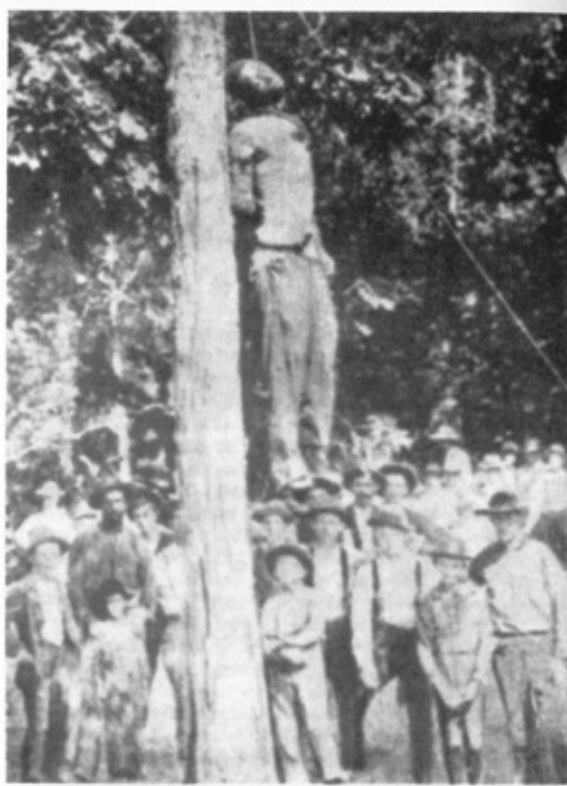
Scene of lynching at Clanton, Alabama, August 1891.