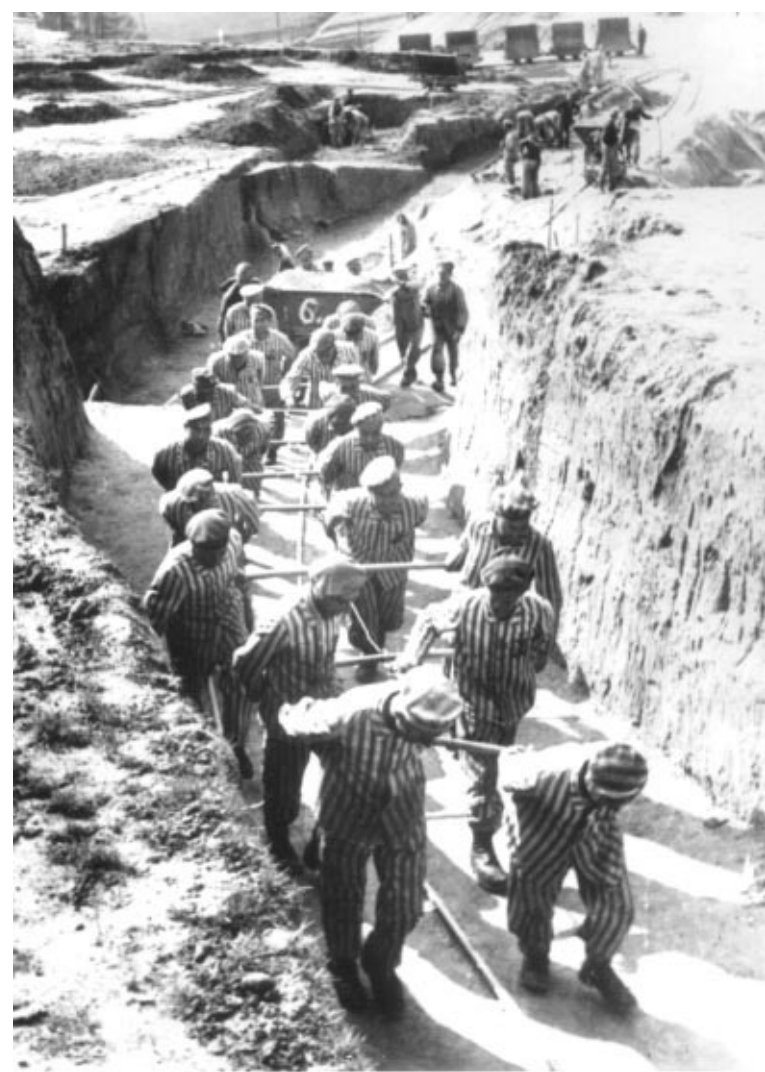
Inmates at forced labor in the Mauthausen con- centration camp.