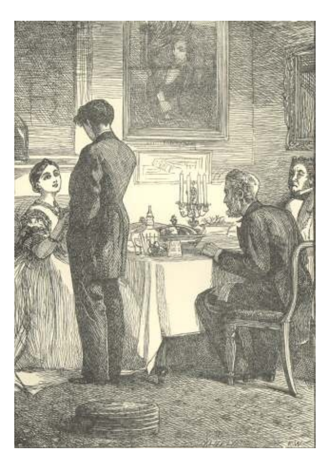
CHAPTER III THE WHELP

Both in his sister's presence, and after she had left the room, the whelp took no pains to hide his contempt for Mr. Bounderby, whenever he could indulge it without the observation of that independent man, by making wry faces, or shutting one eye. Without responding to these telegraphic communications, Mr. Harthouse encouraged him much in the course of the evening, and showed an unusual liking for him. At last, when he rose to return to his hotel, and was a little doubtful whether he knew the way by night, the whelp immediately proffered his services as guide, and turned out with him to escort him thither.