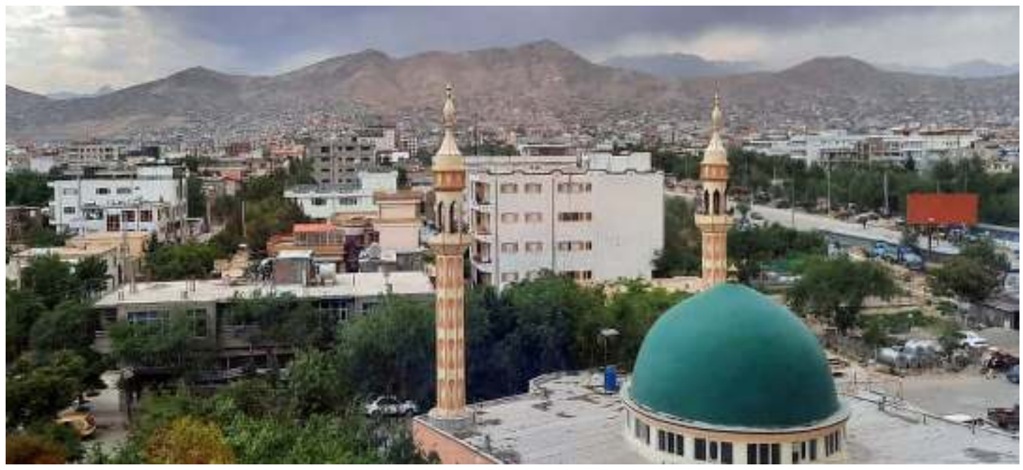
A mosque in Khair Khana, Kabul, Afghanistan.

14 August 2020 Human Rights (/en/news/topic/human-rights)