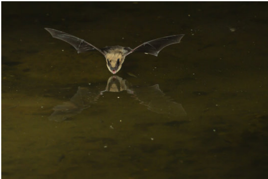
Big brown bat (stock image).