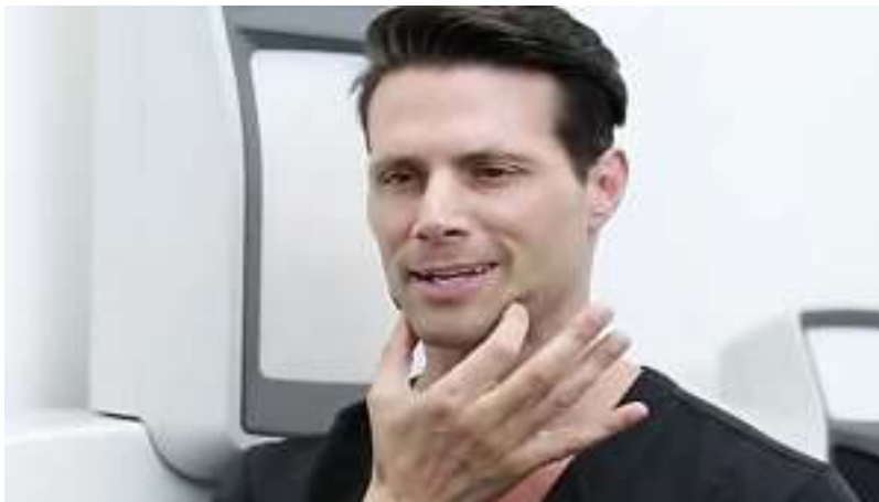
Surgeon: "Doing This Every Morning Can Snap Back Sagging Skin (No Creams Needed)" Beverly Hills MD