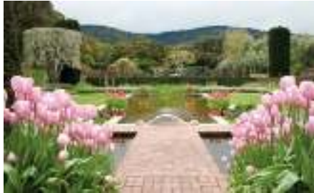
The gardens at the Woodside's historic Filoli estate will reopen to the public on Monday, May 11, with attendance capped, social distancing observed and visitors asked to wear face coverings.

With the arrival of spring, the formal gardens at Woodside's Filoli estate are in full flower — and at this time of year, they're typically full of visitors, too — but since March's shelter-in-place order, the only way to get a glimpse of the gardens has been via Filoli's Instagram account . Starting Monday, May 11, visitors can once again enjoy the sights and scents of the estate's 16 acres of gardens in bloom, as portions of Filoli's grounds reopen to visitors.