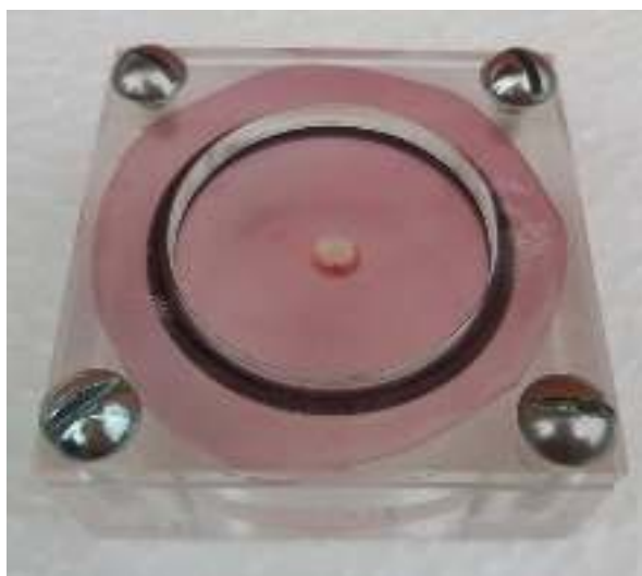
Figure 1. Acrylic cell, 4.5 cm in diameter, 5 cm height.

HMP - high-methoxyl pectin; LMP - low-methoxyl pectin; CMC - carboxymethylcellulose; SA - sodium alginate; LBG - locust bean gum; HPMC - hydroxypropyl methylcellulose.