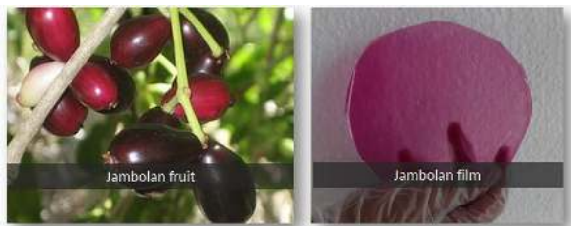
Figure 4. Jambolan fruit and its high-methoxyl pectin film.

polysaccharides, loaded as CMC and SA. These polysaccharides facilitate strong interactions with the mucosa, resulting in high adhesive strength. Studied have shown that charged polymers increase the adhesion by leading to stronger bonds between the film and the buccal surface (Morales and McConville, 2011; Okeke and Boateng, 2016).