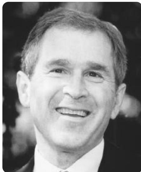
George W. Bush.

In 1977, after the unsuccessful business venture, Bush became interested in politics