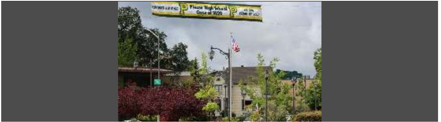
A sign congratulating Placer High School's Class of 2020 hangs above Lincoln Way outside of Central Square in Downtown Auburn this week.