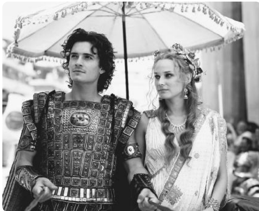
Orlando Bloom (left) and Diane Kruger in a movie still from Troy (2004).

Bloom continued to appear in films that challenge him physically, and he also shared the screen with some of Hollywood's more established heartthrobs. In 2003 he costarred in Ned Kelly , a shoot-'em-up movie about a notorious Australian outlaw. Australian hunk Heath Ledger (1979–) played the lead, while Bloom portrayed Joe