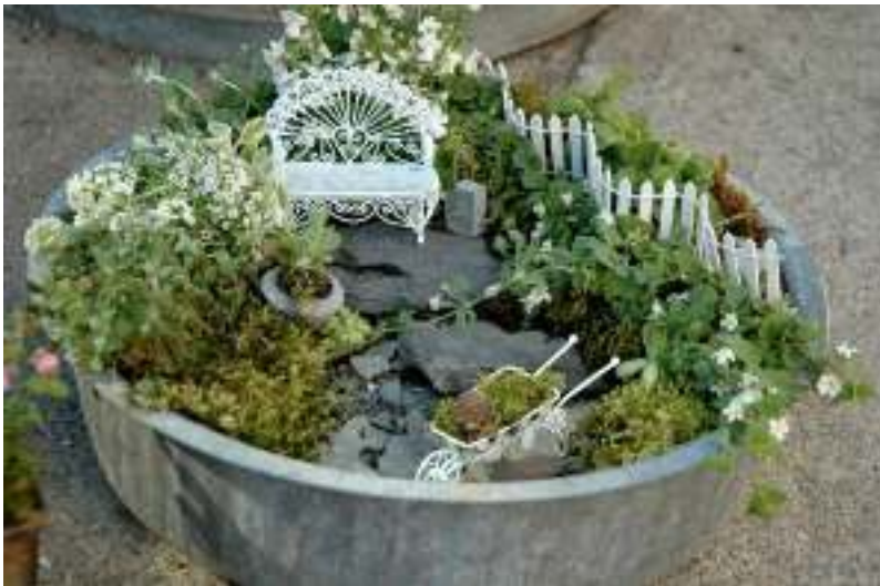
The Wee Garden