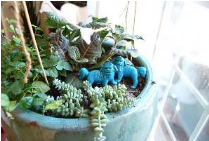
The photo above is from a few months ago....

much of the Foo dogs and their play land. I guess I could cut them back but who am I kidding, I'm not going to be doing that.