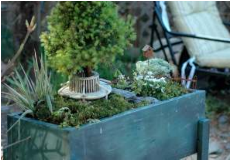
The Wee Garden

APRIL 16, 2012 FILED UNDER: PLANTY, SEASONAL, SHOP THE HOUSE, UNCATEGORIZED