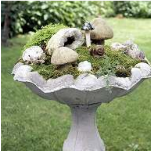
BHG :: Stop the world!