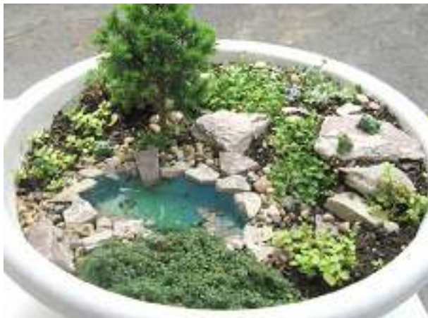
two green thumbs

Have you seen all the adorable miniature garden ideas? Containers of some sort (wood boxes, planters, drawers, wheel barrows, bird baths...) hold a little scene full of tiny living plants along with little adornments like garden benches, hardscapes and paths. They are absolutely enchanting for all ages and how fun to shop the house and find special little things to decorate your tiny garden whether indoors or out.