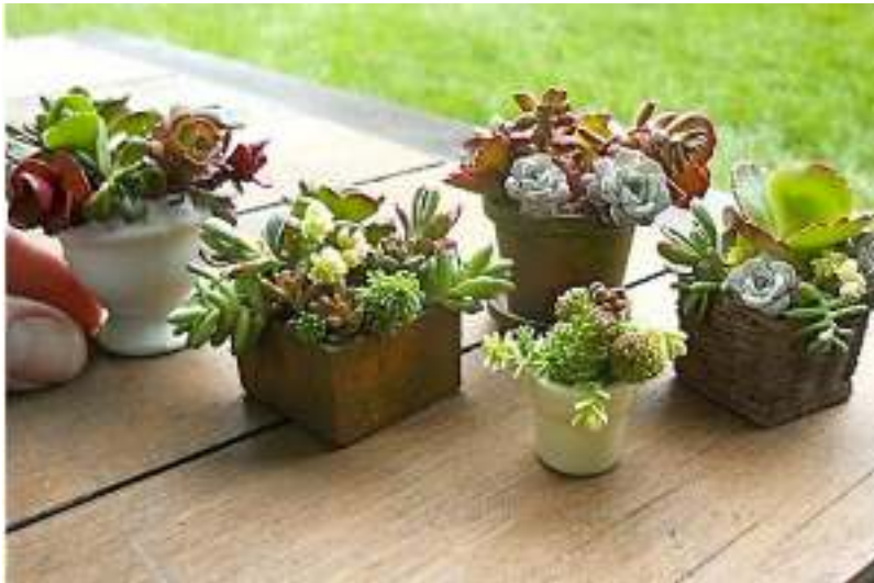
Janit @ Two Green Thumbs

Not only can you plant real, live tiny plants in your garden. Consider little succulent cuttings planted in little baskets, urns and tiny pots. Be still my beating heart! Check out Janit's etsy shop for more ideas– and if you are really ambitious, you can buy a 20 minute phone session with Janit.