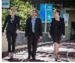
Hourly Rates Of Lawyers In Lasalle Might Surprise You