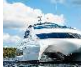
Porsche-Designed Superyacht, Royal Falcon One, Hits the Market