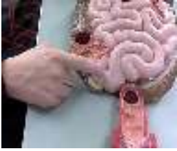
Top Gut Doctor: I Beg All Americans To Throw Out This Vegetable