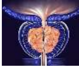
Urologist: Try This If You Have Enlarged Prostate (Watch)